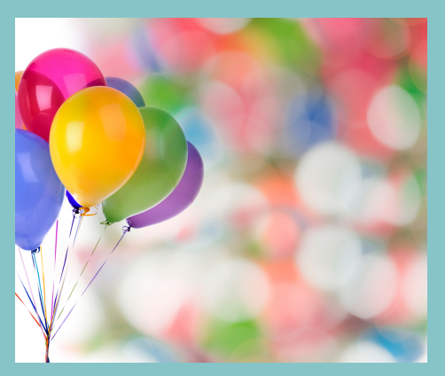
Life without friendship is like the sky without the sun, a bird without a song, or a plant without a flower. Friendship is sunlight to the soul. It warms our hearts and brightens our days. It is a gift of infinite worth.