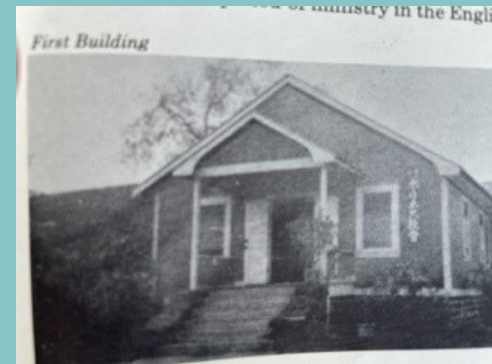
First Church in Moiliili