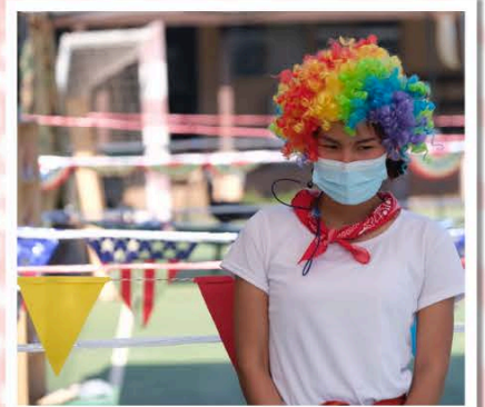
ZOE staff got into the spirit for the 2022 Kids Carnival!