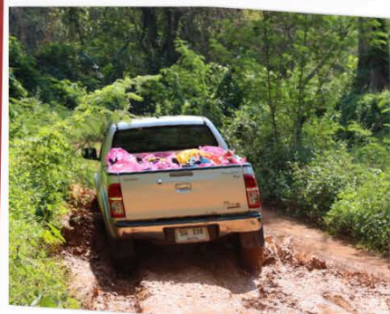
Thank goodness for four-wheel drive . . . especially during Thailand's rainy season!