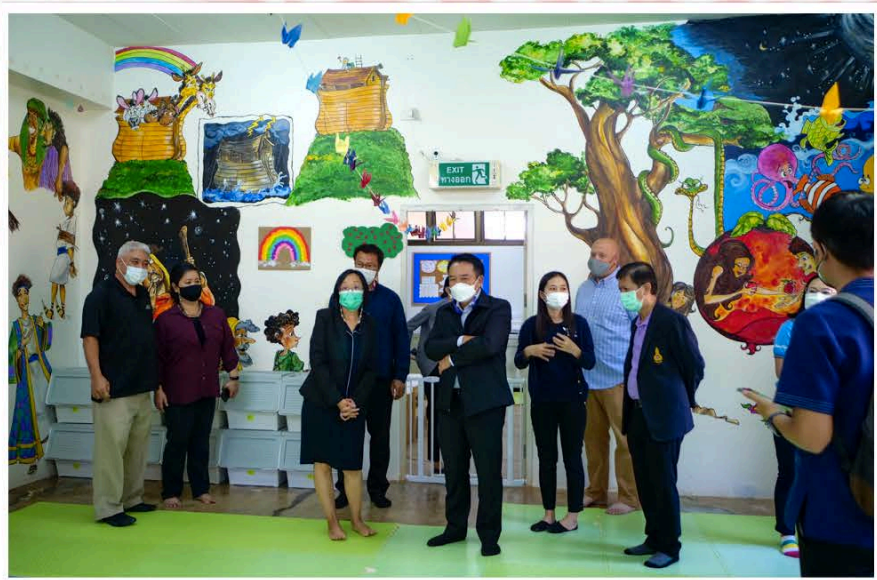
Government officials lauding ZOE for being the first NGO in Thailand to establish a daycare for the sole purpose of benefiting its staff.