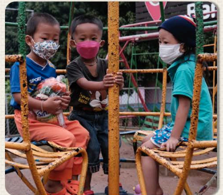
We distributed shoes and other supplies on a two-day outreach in Mae Hong Son Province.