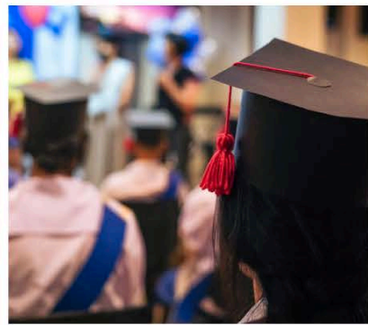
A good education is one of the greatest tools we can give our kids.