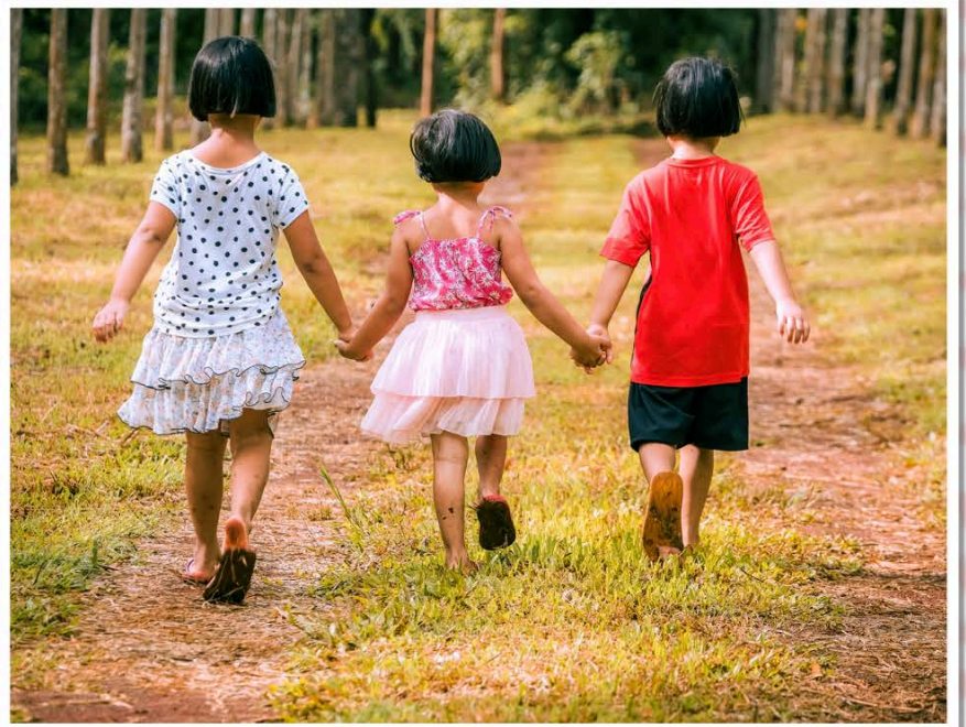
"There is so much love poured out at ZOE. And you see the kindness and grace of God over this place. This is a place of hope for the children. I pray for ZOE's future . . . and that many more kids will be rescued." ~ former ZOE child