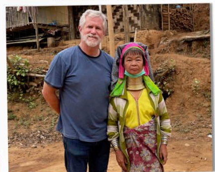
This winsome woman is a member of the Karen "long neck" hill tribe.