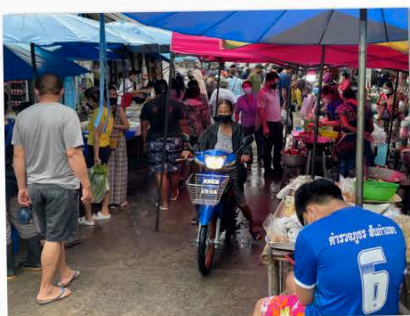
Keep on your toes while navigating Chiang Mai's busy street markets. Otherwise, you might find tire tracks on them!