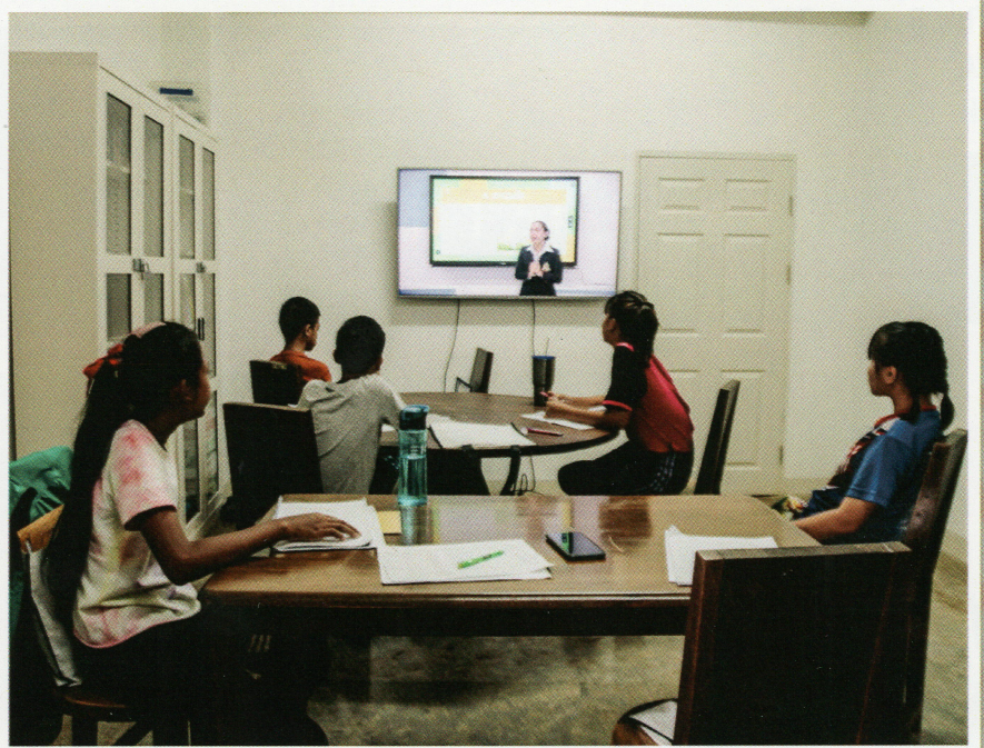
For six weeks while waiting for Thai schools to re-open, our ZOE kids attended online classes. The Thai government provided standardized classes for each grade, so that all students across the nation received the same instruction during the lockdown.