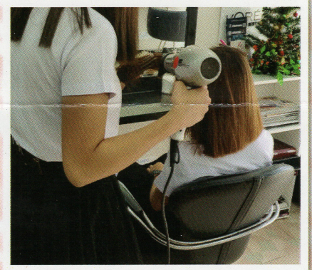
ZOE's Vocational School has a salon to teach hair styling.