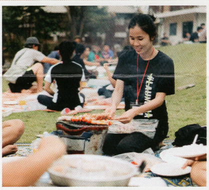
One of our favorite ZOE family activities is BBQ on the lawn.