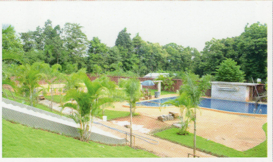
ZOE's Facilities Maintenance crew refurbished our pool area and it's ready for a summer of swimming, beach volleyball, and hanging out with friends and family.