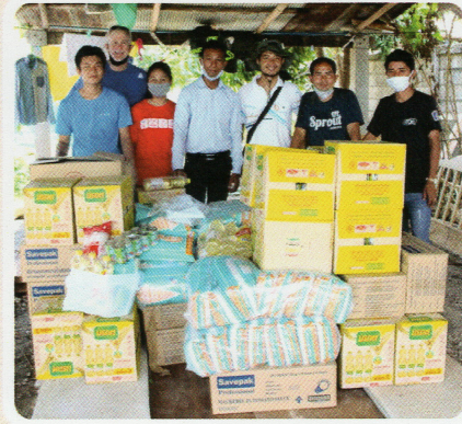
Food for the hungry